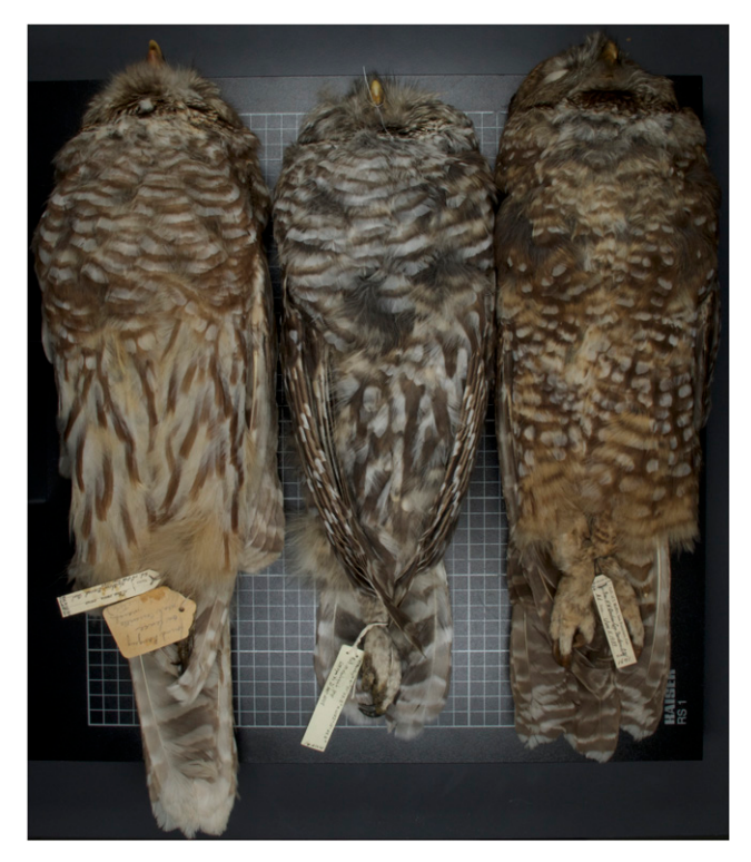
Figure 1 Comparison of eastern barred owl, Siskiyou County barred owl, and northern spotted owl plumages. This image displays the darker ventral plumage of a Strix varia collected in Siskiyou County, California compared with that of typical S. varia and S. occidentalis caurina individuals. On the left is the ventral plumage of a Strix varia from eastern North America. In the center is a S. varia from Siskiyou County, California. On the right is a S. occidentalis caurina from northern California.

Hybridization of Strix varia and S. occidentalis has previously been investigated using a set of four microsatellite (Funk et al. 2007) and fourteen amplified fragment-length polymorphism (Haig et al. 2004) markers, which the authors found useful for diagnosing F_1 and F_2